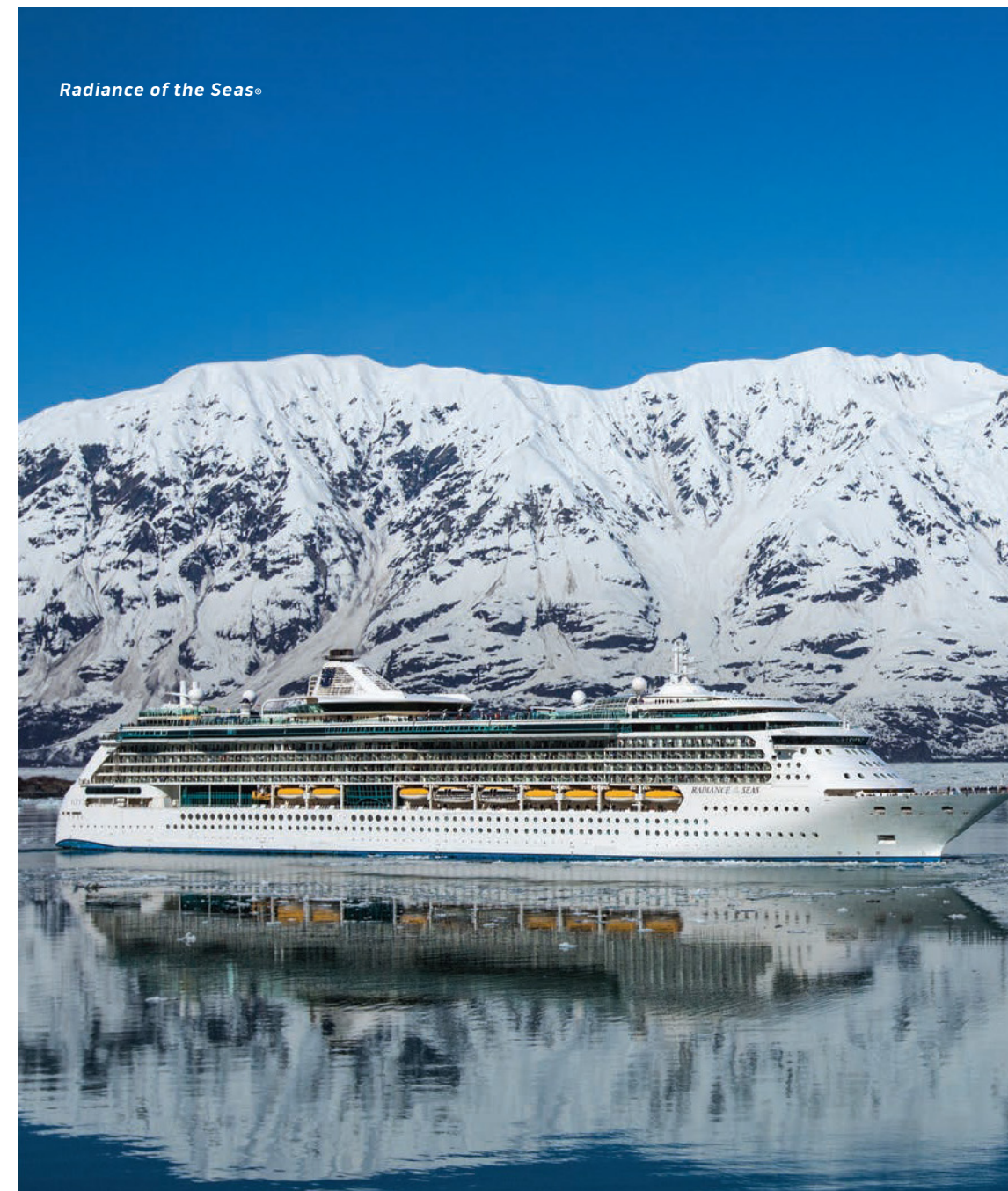
Radiance of the Seas®

KIDS AND TEENS — The award-winning Adventure Ocean® Youth Program delivers games, events, educational activities and more for kids ages 3 to 11. And teens get their own places to chill, plus activities from games and sports to karaoke and dance parties.