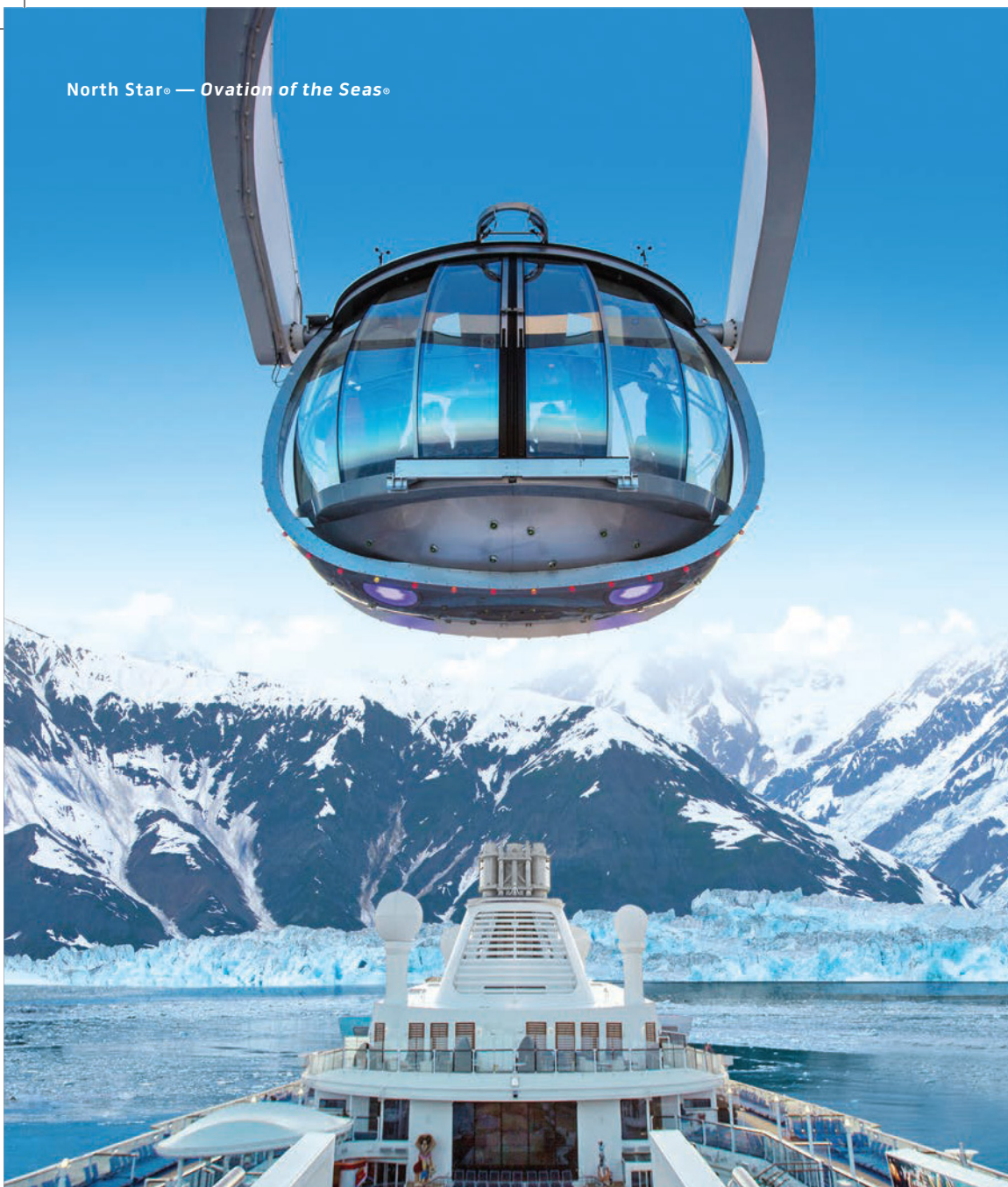
North Star® — Ovation of the Seas®